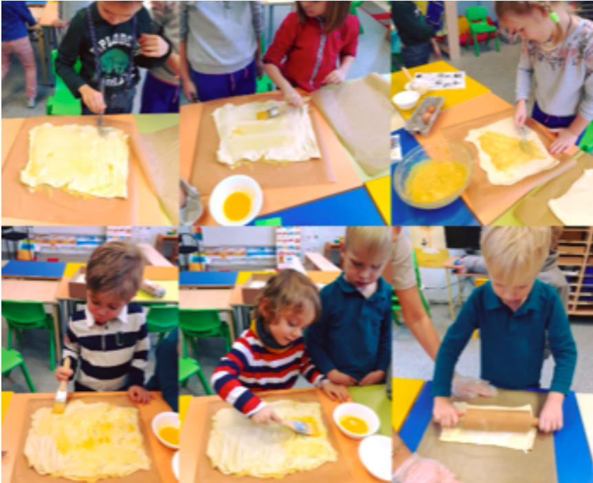
Galette des rois - French tradition